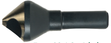
Type 82-AG - Pilotless