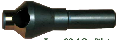
Type 82-AG - Piloted

Type 82-AG Chatterproof™ Countersinks Type 90-AG Chatterproof™ Deburring Tools